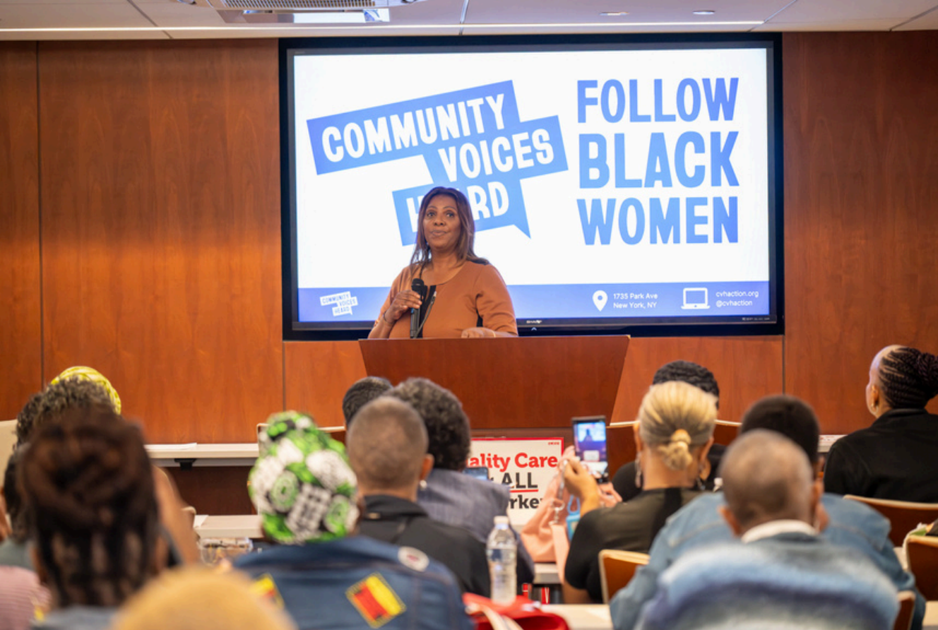
Attorney General Letitia James at our Follow Black Women: We Are the Agenda event in September.