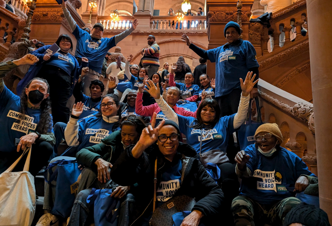
CVH Members on the Million Dollar Staircase at the capitol building in Albany, NY.